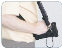
4-point Shoulder Strap