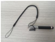
Straps and Touch pen